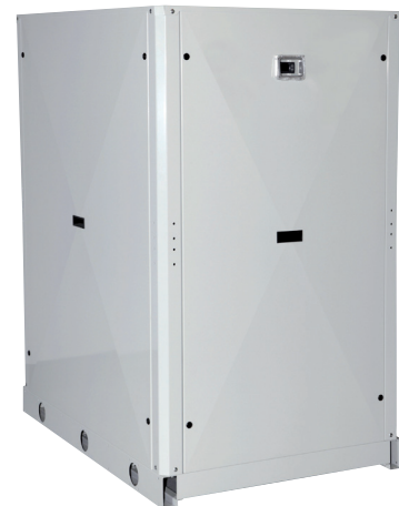
Unit with closing panels